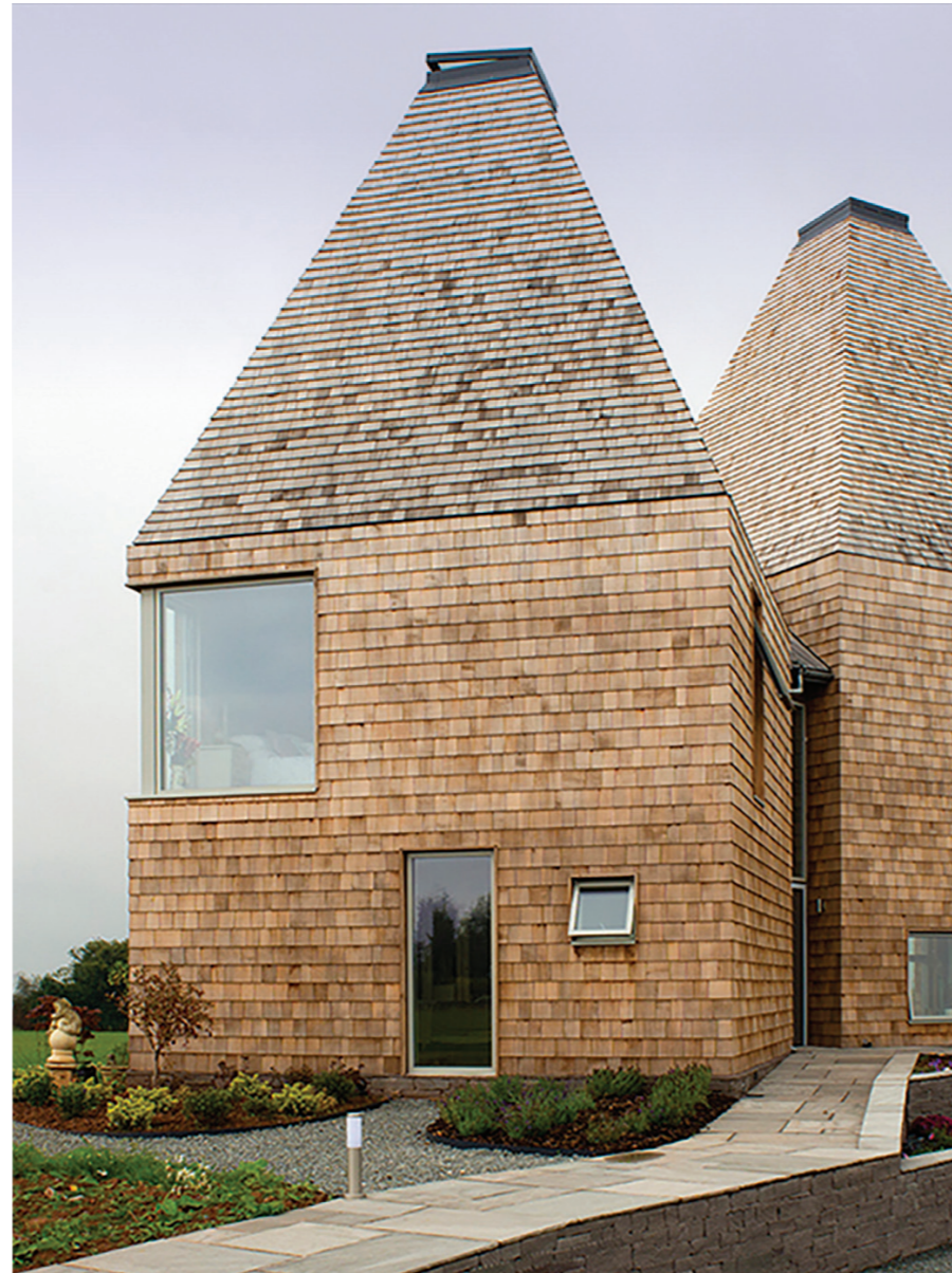
Fuggles Pocket - A unique self build detached 2-storey private residential dwelling situated on a 20 acre site in rural Worcestershire.

We will issue the final invoice and, once all relevant information is received, forward the project Operation and Maintenance (O&M) Manual along with our Completion Certificate.